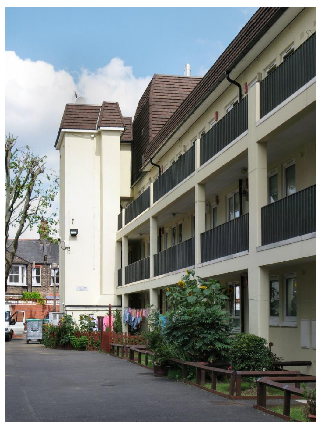
A housing cooperative building with a sunflower growing in the community garden out the front.