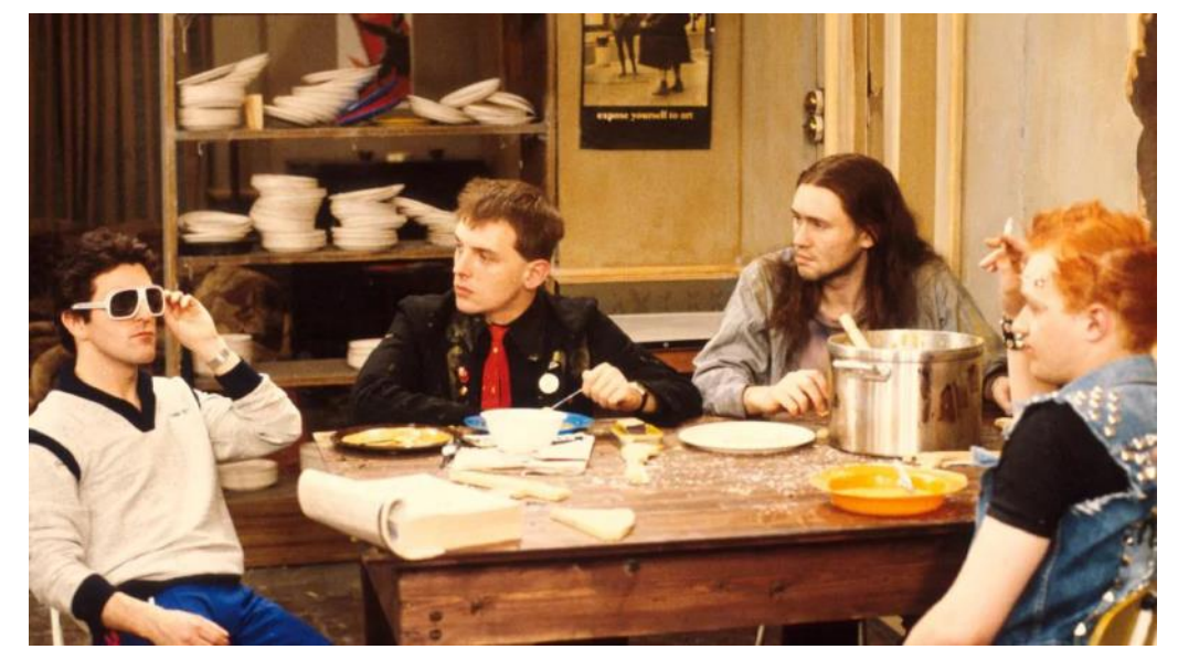
The BBC TV Show Young Ones was an infamous example of sharehousing. But these days, sharehousing is not only for young people.