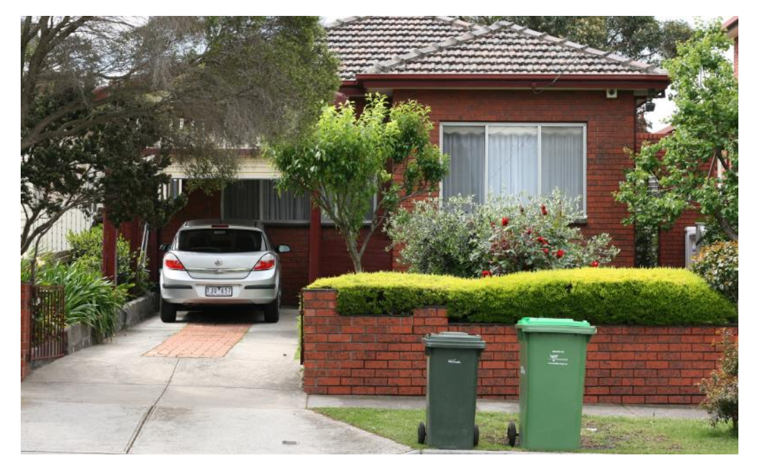
Many public and community houses look like a standard suburban homes.