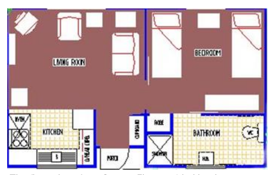
The floor plans for a Granny Flat provided by the Department of housing