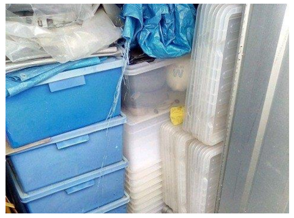
An older person living in a private rental house keeps plastic storage containers ready for if they are told they have to move

For most of us, we don't want to keep moving around all the time. If you need the security of a place you can stay for as long as you want, you can look at the 'how long can you stay' box at the bottom of each page.