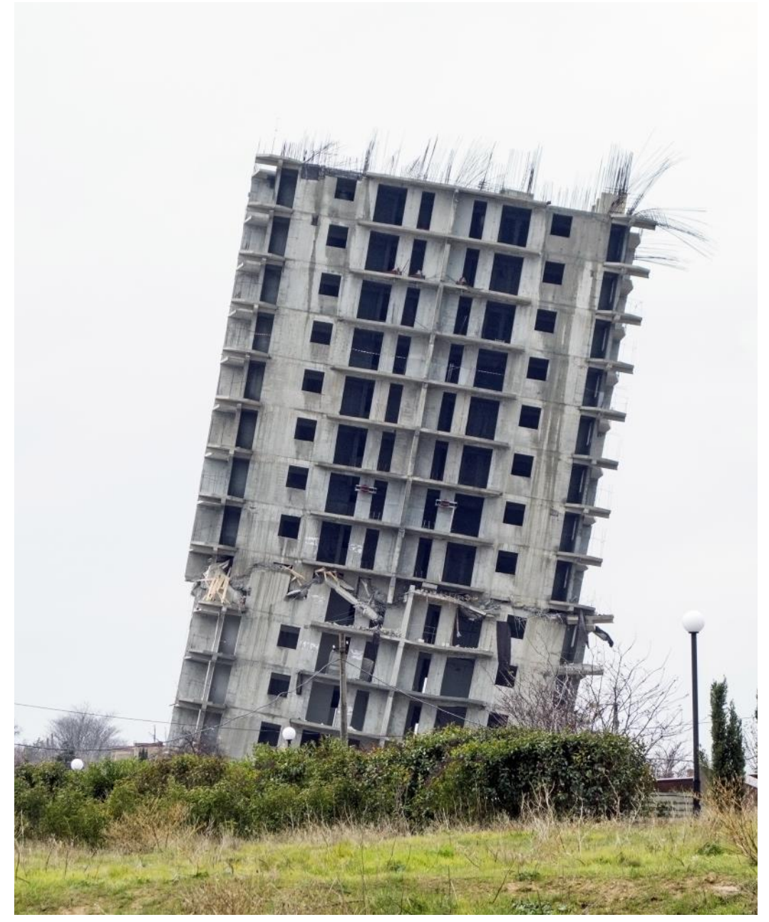
Some very unsafe housing in Sevastopol, Russia. If you're housing looks - or feels like this, give us a call and we'll come to the rescue.