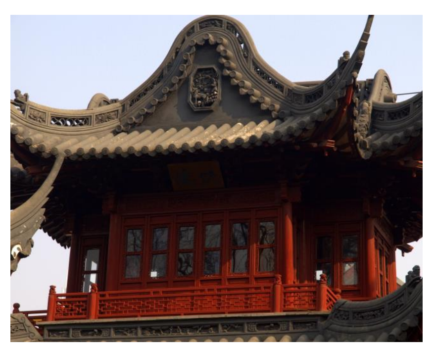
Granny Flats are not a new idea! Here is an example of a house for an older royal widow in ancient China.