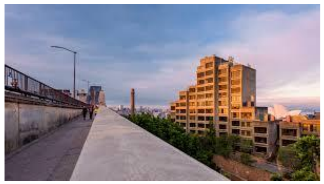
A more unusual shaped building, built to be public housing near Sydney Harbour