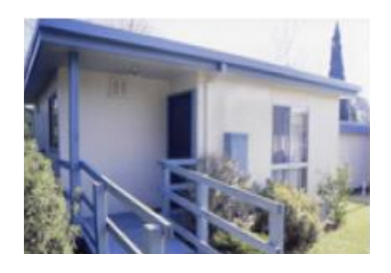
A typical movable unit provided by the Victorian Government

The waiting time for Movable Units is approximately 3-6 months and all connections such as sewerage, electricity and gas are supplied at no charge by the Office of Housing.