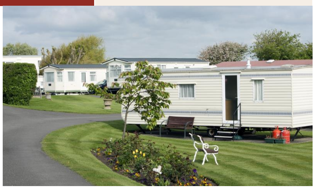
Caravan and residential park houses can look like caravans, but some look more like small houses.

How long can you Caravan parks may be long term accommodation, however you can be asked to leave, or the park could be closed down or redeveloped.