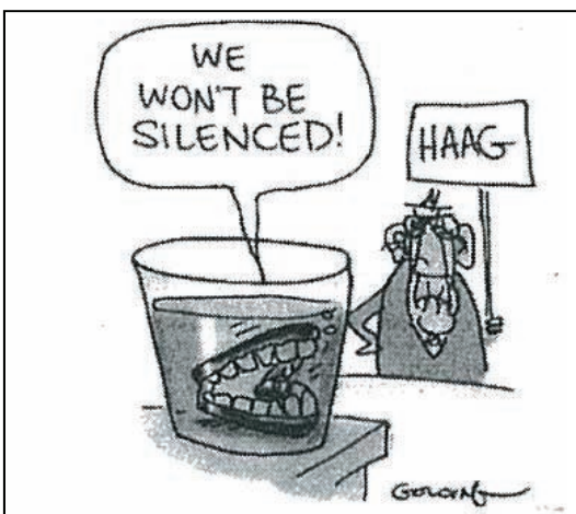
Photo on front cover

Lord Mayors Charitable Foundation (from left to right):