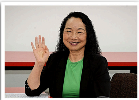
Member at our CALD forum and lunch.

HAAG offers FREE, confidential advice, housing and support to over-50's