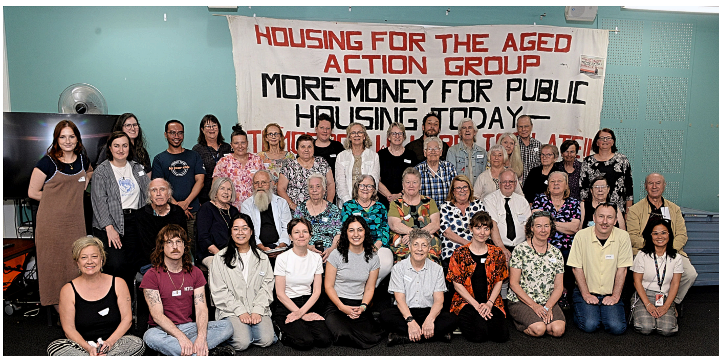
The team of Housing for the Aged Action Group, now in our forty-first year, still demanding "MORE MONEY FOR PUBLIC HOUSING TODAY!"