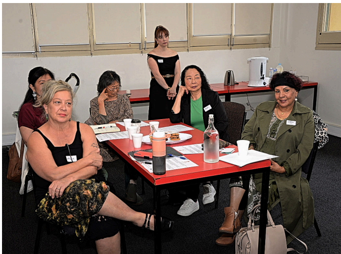
Thanks to all the participants of the meeting, and a big thanks to Guru for the photos!