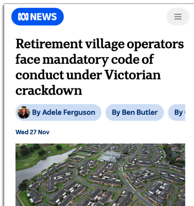
HAAG continued to feature in the news with coverage focussing on the new Bill

We, alongside our partners and residents of retirement villages, have also been calling for an Ombudsman to resolve disputes. The introduction of a new alternative dispute resolution service within the Department of Government Services is a step in the right direction. It must provide a free and easily accessible service for residents, as well as the ability to make binding decisions on operators. We look forward to working with the Government to develop this new service.