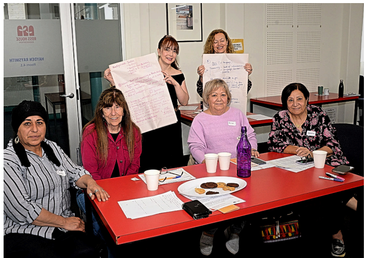
Groups discussed how homelessness is perceived in their communities and where people go for information.