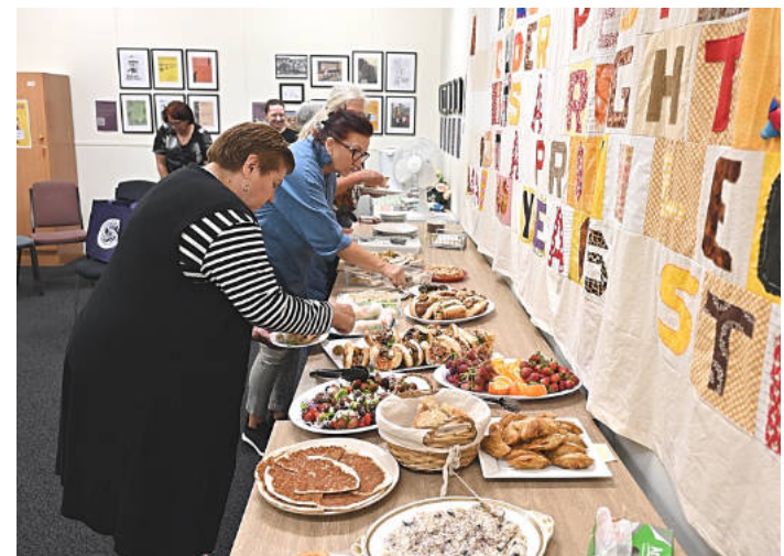
Our Multicultural & Multifaith working group also led a celebration of Cultural Diversity Week, sharing a lunchtime feast with members and staff.