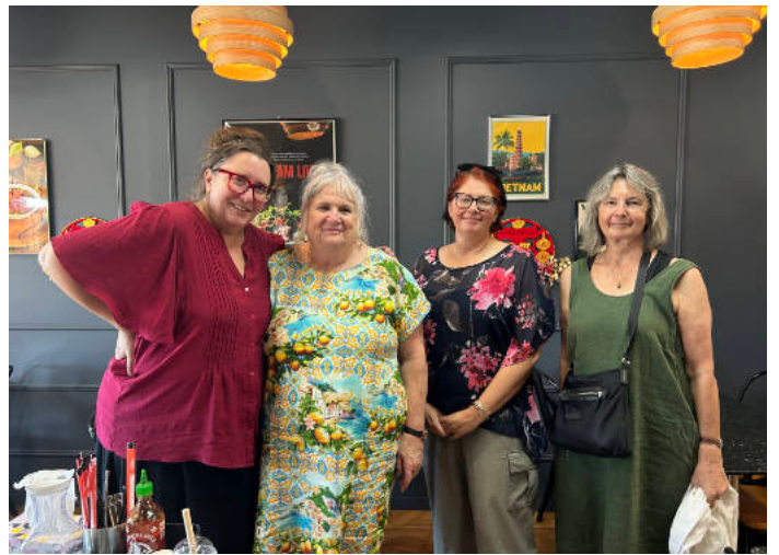
We got the chance to visit our sister organisations in Queensland. The Housing Older Women's movement are in the construction phase of their first cooperative housing, while Footprints is delivering their service for older women with community outreach across the state.