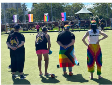
Richmond Union Bowling Club Pride Cup.

HAAG offers FREE, confidential advice, housing and support to over-50's